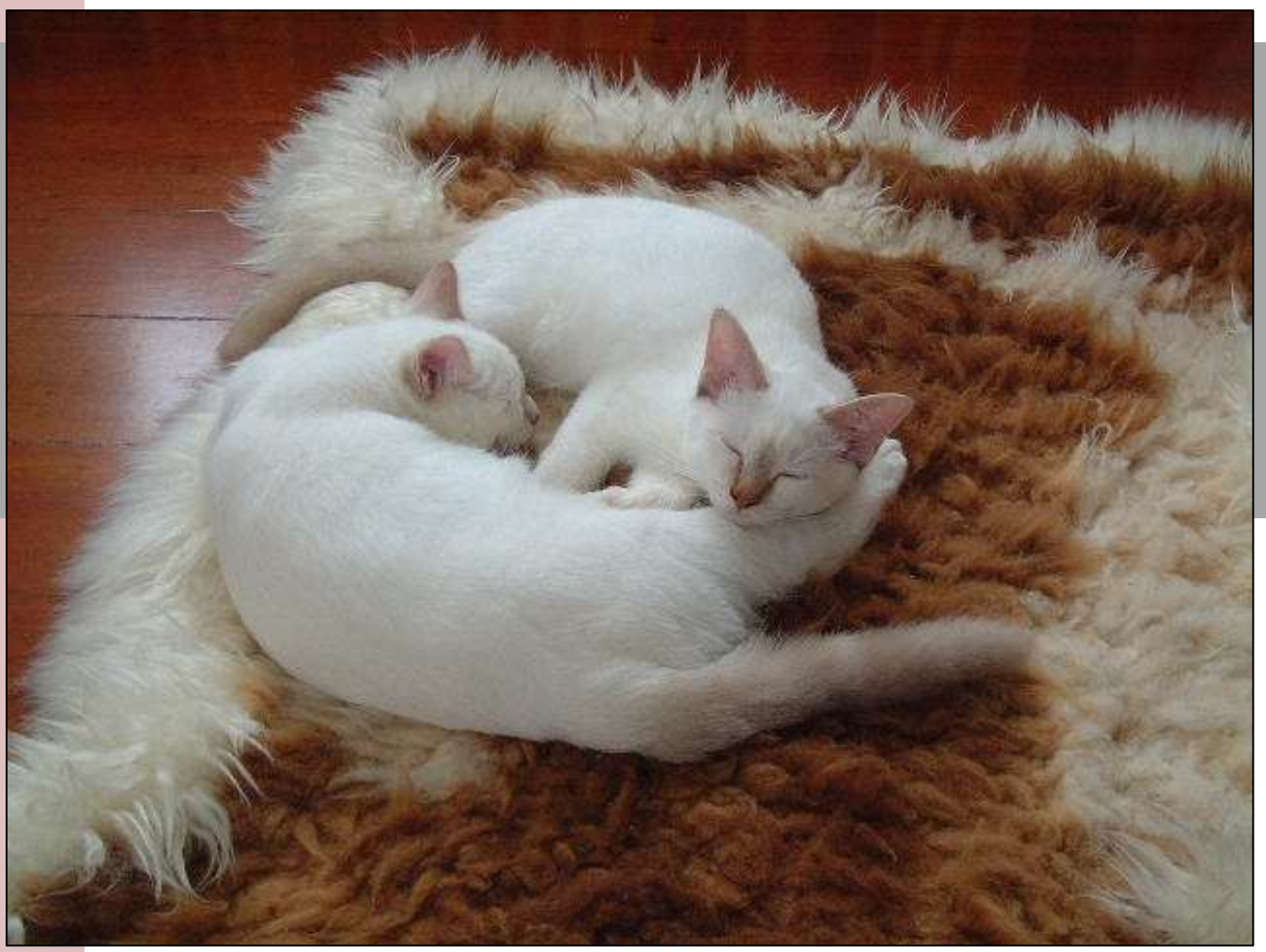
Templecat pets at rest, the perfect short-haired cat for the home or apartment.

And amazingly, in this same litter (born October 18, 2000) was produced the first full register Fawn-point Birman Shorthair, "Rakesha Golden Girl". Truly a golden result from an amazing breeding queen.