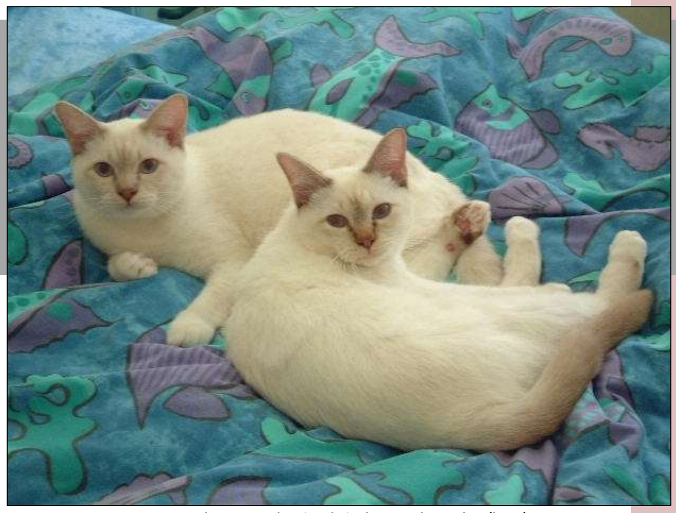
Templecat pets, showing their gloves and gauntlets (laces)