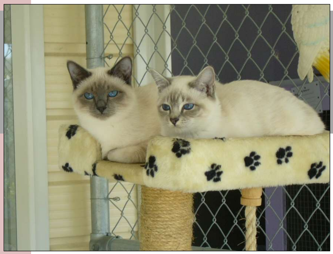
Rakesha Quasar Blue (Blue Point Neuter) and Rakesha (Blue Tabby Point Spay)

Rakesha Jazz Singer and on November 5, 1995 was born the second generation of Birman Shorthair kittens. This litter included two cats critical to the ongoing breeding program, "Rakesha Bruno Bear", a Chocolate point Longhair and "Rakesha Bon Bon", a Chocolate point shorthair.