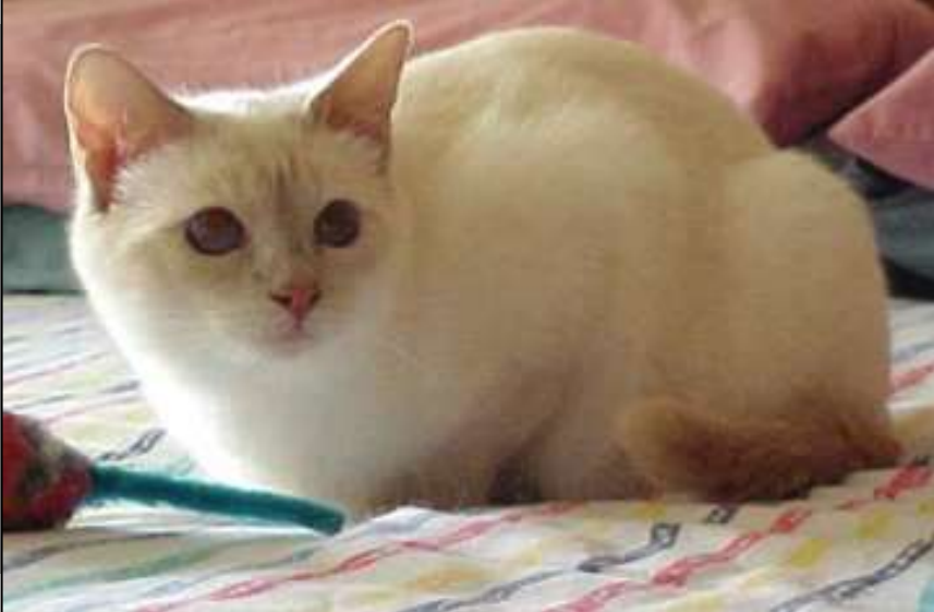
Littermates: Rakesha Gingernut (Cinnamon Point male) and Rakesha Golden Girl (Fawn Point female) Born October 18, 2000