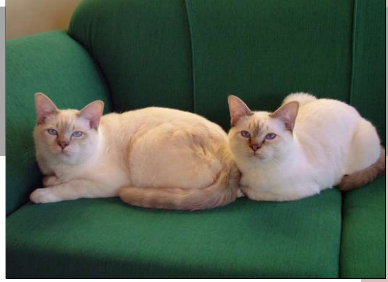
Rakesha Whiskey (Lilac Tabby Point) and Rakesha Willy Nilly (Chocolate Tabby Point)

Birman female SITA had given birth to the only pure Birman litter in 1920, in Nice, France, and a female kitten from that litter named "Poupee" was considered at that time to be the perfect example of a Birman. But without a male for "Poupee" to be bred to, she herself had been outcrossed to a Siamese cat, in order that the breed could be re-established.