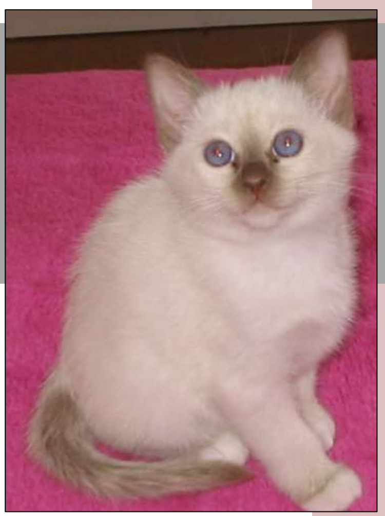
Chocolate Point Templecat kittens in 2011.

That which follows, is in the first instance, an article I wrote about the Templecat in 2011, a full 16 years after the first filial cross, ten years after it had been adopted by CATZ Inc as an NBC breed, and 7 years after it had gained recognition as a Championship breed. It should be read with that contextual setting in mind. It shows the early progression of the breed as it was developed, along with a mix of images of breeding cats, the occasional show cat and numerous Templecats that were sold as pets. As the founder of this breed is now retired and as an octogenarian can no longer devote the time to continue development of the breed, her valuable lines have been faithfully conserved by a new generation of breeders who have risen to the challenge of maintaining and enlarging the gene pool. That story follows on from this first one.