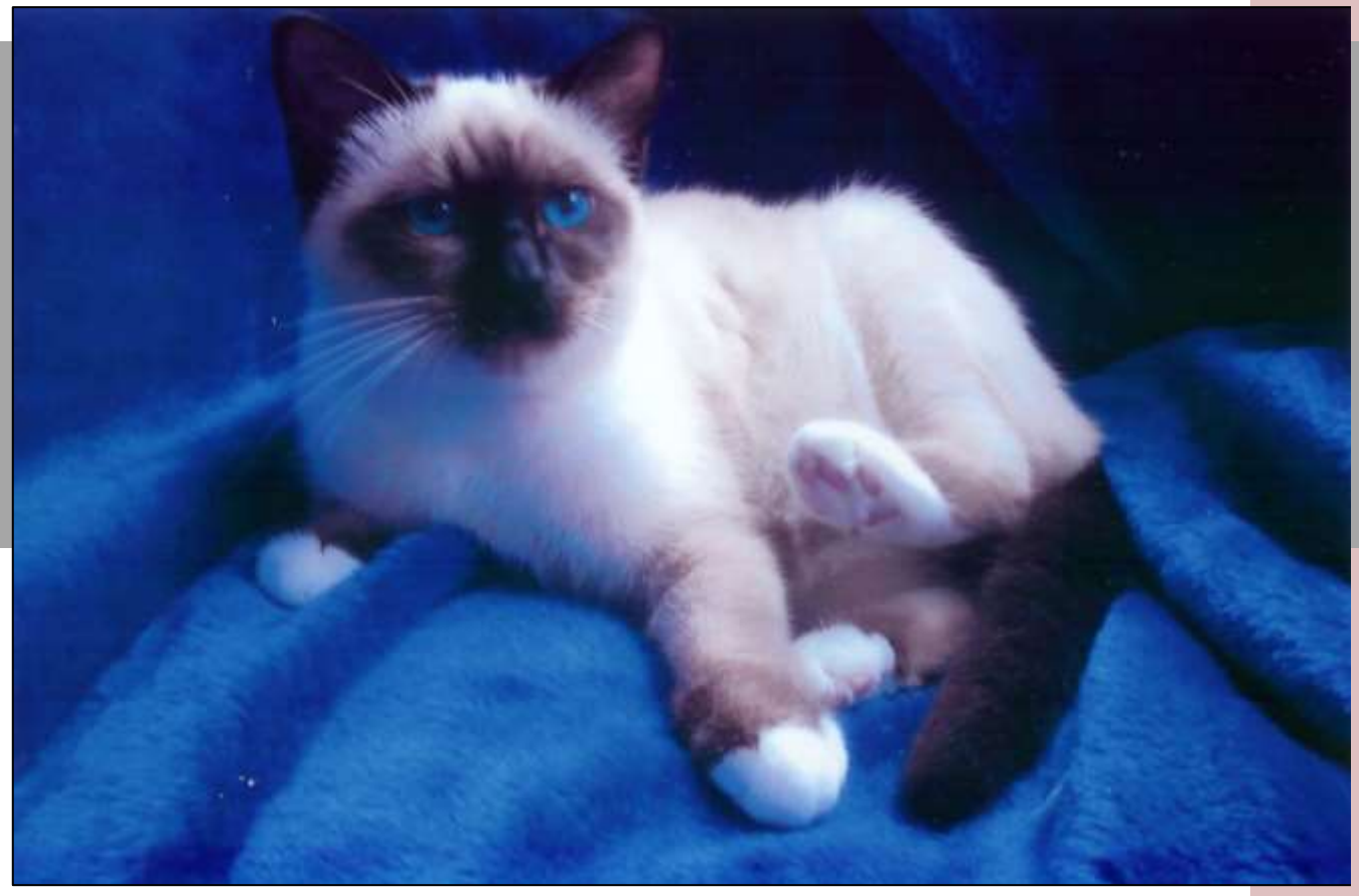
Ch. Trelliams Practically Perfect, a Seal-point Templecat, shown here as a kitten. The first entire Templecat to win a Best In Show, on this occasion under TICA AB Judge Yuki Hattori (Japan).

Birman breed, then care must be taken to recognise that in Birmans themselves, there have historically been issues surrounding blood compatibility (with breeding stock), and this needs to be recognised and tested for in possible introductions of new Birman lines into any future Templecat breeding program.